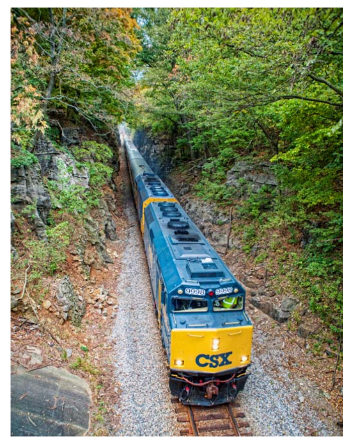
Above: A CSX Executive Train heads Southbound on October 10, 2012 approaching Adams, Tn on the Henderson Subdivision headed up by CSX's F40PH-2 #9998 on the head end.